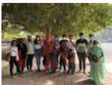
Reignite Program for Women Restarting their Careers